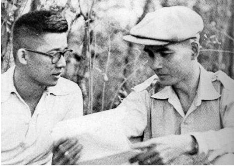
Figure 2: Benigno “Ninoy” Aquino (left) and Luis Taruc reviewing President Raymond Magsaysay’s response to Taruc’s call for peace, 1954 (copy of photo that appeared in Manila Times , Taruc’s personal collection).